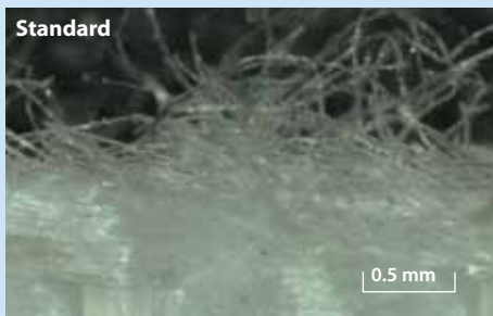
Belt edges after the impact of a defined force.

Frayfree belt types are particularly suitable for conveying packaged and unpackaged food, e.g. confectionery and baked goods.